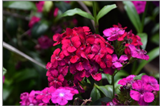
Amazon Neon Cherry Pinks flowers

Amazon Neon Cherry Pinks will grow to be about 30 inches tall at maturity, with a spread of 15 inches. When grown in masses or used as a bedding plant, individual plants should be spaced approximately 12 inches apart. Its foliage tends to remain dense right to the ground, not requiring facer plants in front. Although it's not a true annual, this plant can be expected to behave as an annual in our climate if left outdoors over the winter, usually needing replacement the following year. As such, gardeners should take into consideration that it will perform differently than it would in its native habitat.