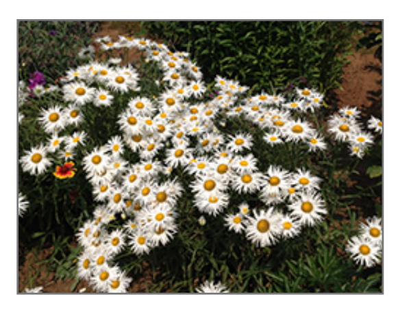
Crazy Daisy Shasta Daisy in bloom