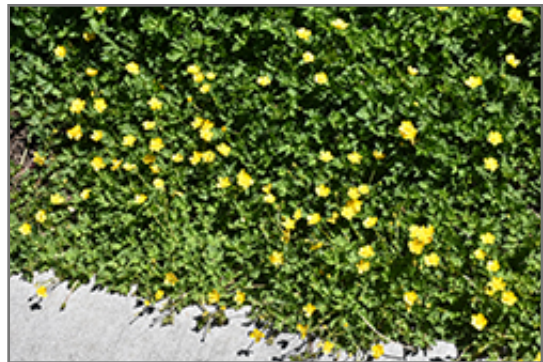
Barren Strawberry in bloom