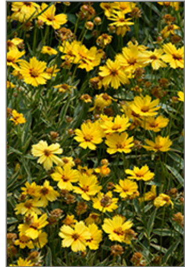
Tequila Sunrise Tickseed flowers