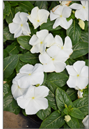
Cora XDR White flowers

Cora XDR White is recommended for the following landscape applications;