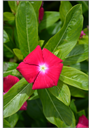
Cora XDR Cranberry flowers

Cora XDR Cranberry is a fine choice for the garden, but it is also a good selection for planting in outdoor containers and hanging baskets. It is often used as a 'filler' in the 'spiller-thriller-filler' container combination, providing a mass of flowers against which the thriller plants stand out. Note that when growing plants in outdoor containers and baskets, they may require more frequent waterings than they would in the yard or garden.