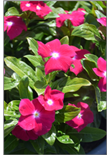
Cora XDR Cranberry flowers

Cora XDR Cranberry is recommended for the following landscape applications;