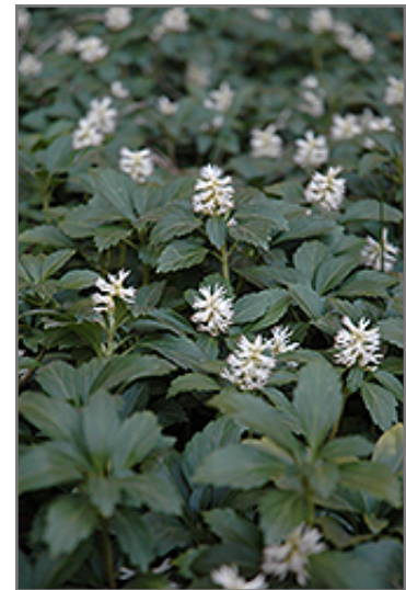
Japanese Spurge flowers