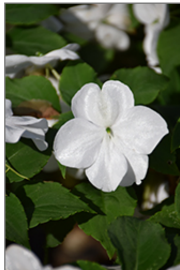
Beacon White Impatiens flowers

Beacon White Impatiens is recommended for the following landscape applications;