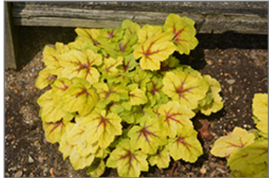
Catching Fire Foamy Bells

This is a relatively low maintenance plant, and should be cut back in late fall in preparation for winter. It is a good choice for attracting hummingbirds to your yard. It has no significant negative characteristics.