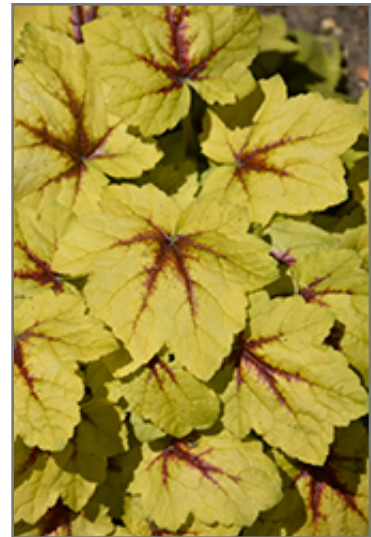
Catching Fire Foamy Bells foliage