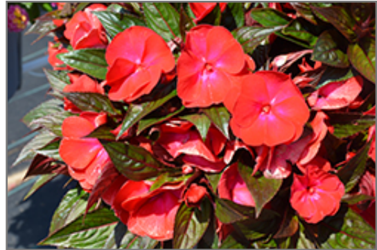
Magnum Red Flame New Guinea Impatiens flowers

Magnum Red Flame New Guinea Impatiens will grow to be about 8 inches tall at maturity, with a spread of 14 inches. When grown in masses or used as a bedding plant, individual plants should be spaced approximately 12 inches apart. Its foliage tends to remain low and dense right to the ground. This fast-growing annual will normally live for one full growing season, needing replacement the following year.