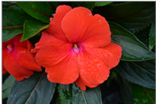
Magnum Red Flame New Guinea Impatiens flowers

Magnum Red Flame New Guinea Impatiens is recommended for the following landscape applications;