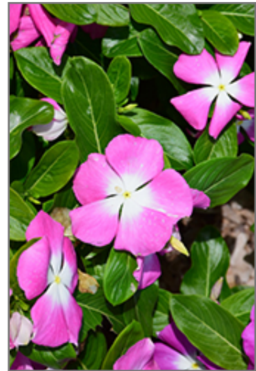
Mega Bloom Pink Halo Vinca flowers

This plant will require occasional maintenance and upkeep, and should not require much pruning, except when necessary, such as to remove dieback. It is a good choice for attracting butterflies to your yard, but is not particularly attractive to deer who tend to leave it alone in favor of tastier treats. It has no significant negative characteristics.