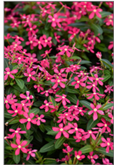
Soiree Kawaii Coral Vinca flowers

Soiree Kawaii Coral Vinca is recommended for the following landscape applications;