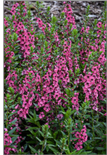
Angelface Perfectly Pink Angelonia flowers

Angelface Perfectly Pink Angelonia is a fine choice for the garden, but it is also a good selection for planting in outdoor containers and hanging baskets. With its upright habit of growth, it is best suited for use as a 'thriller' in the 'spiller-thriller-filler' container combination; plant it near the center of the pot, surrounded by smaller plants and those that spill over the edges. Note that when growing plants in outdoor containers and baskets, they may require more frequent waterings than they would in the yard or garden.