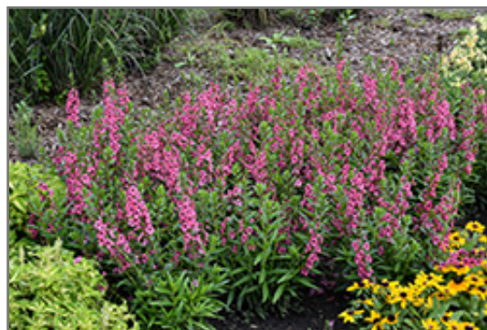
Angelface Perfectly Pink Angelonia in bloom