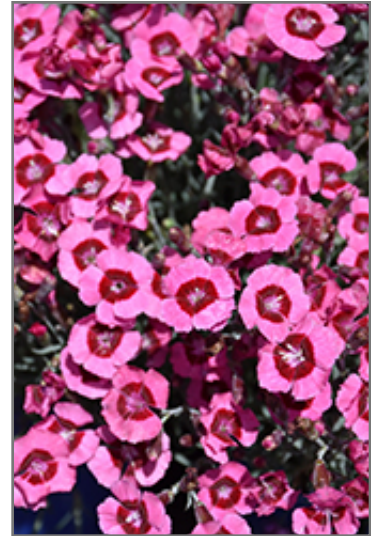
Star Single Peppermint Star Pinks flowers

Star Single Peppermint Star Pinks is an herbaceous evergreen perennial with a mounded form. It brings an extremely fine and delicate texture to the garden composition and should be used to full effect.