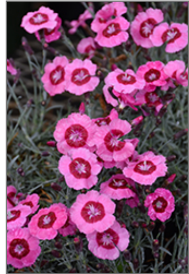
Star Single Peppermint Star Pinks flowers

Star Single Peppermint Star Pinks is a fine choice for the garden, but it is also a good selection for planting in outdoor pots and containers. It is often used as a 'filler' in the 'spiller-thriller-filler' container combination, providing a mass of flowers and foliage against which the thriller plants stand out. Note that when growing plants in outdoor containers and baskets, they may require more frequent waterings than they would in the yard or garden.