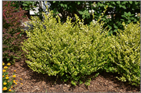
Cesky Gold Dwarf Birch