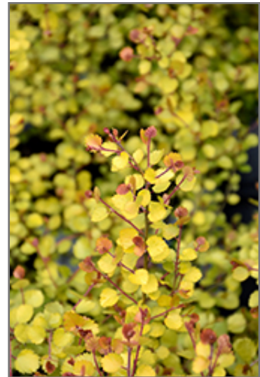
Cesky Gold Dwarf Birch foliage