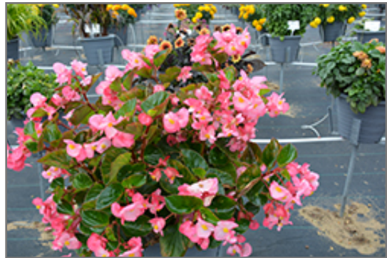
Big Pink Green Leaf Begonia in bloom

Big Pink Green Leaf Begonia is a fine choice for the garden, but it is also a good selection for planting in outdoor containers and hanging baskets. It is often used as a 'filler' in the 'spiller-thriller-filler' container combination, providing a mass of flowers and foliage against which the larger thriller plants stand out. Note that when growing plants in outdoor containers and baskets, they may require more frequent waterings than they would in the yard or garden.