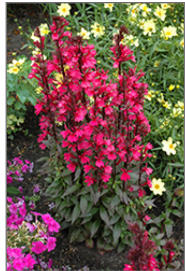
Starship Deep Rose Lobelia in bloom