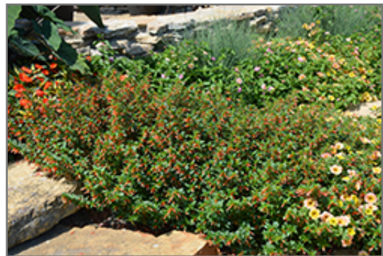
Vermillionaire Large Firecracker Plant in bloom