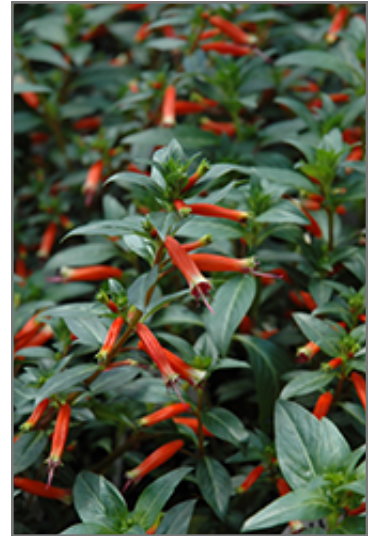
Vermillionaire Large Firecracker Plant flowers

Vermillionaire Large Firecracker Plant is a fine choice for the garden, but it is also a good selection for planting in outdoor pots and containers. With its upright habit of growth, it is best suited for use as a 'thriller' in the 'spiller-thriller-filler' container combination; plant it near the center of the pot, surrounded by smaller plants and those that spill over the edges. It is even sizeable enough that it can be grown alone in a suitable container. Note that when growing plants in outdoor containers and baskets, they may require more frequent waterings than they would in the yard or garden.