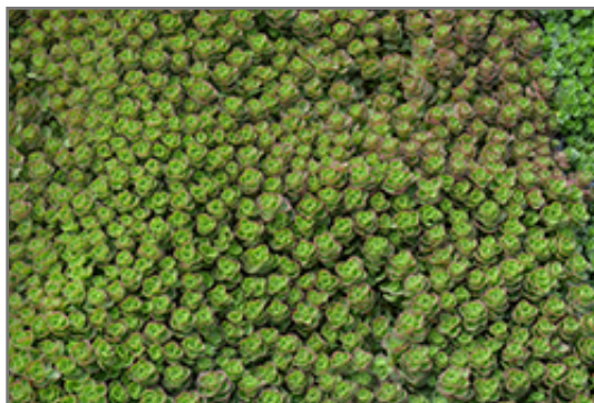
Dragon's Blood Stonecrop foliage