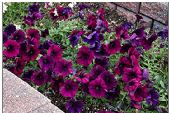
Easy Wave Burgundy Velour Petunia flowers