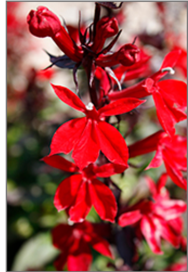
Starship Scarlet Lobelia flowers

Starship Scarlet Lobelia is a fine choice for the garden, but it is also a good selection for planting in outdoor pots and containers. With its upright habit of growth, it is best suited for use as a 'thriller' in the 'spiller-thriller-filler' container combination; plant it near the center of the pot, surrounded by smaller plants and those that spill over the edges. Note that when growing plants in outdoor containers and baskets, they may require more frequent waterings than they would in the yard or garden.