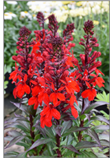
Starship Scarlet Lobelia flowers

Starship Scarlet Lobelia is recommended for the following landscape applications;