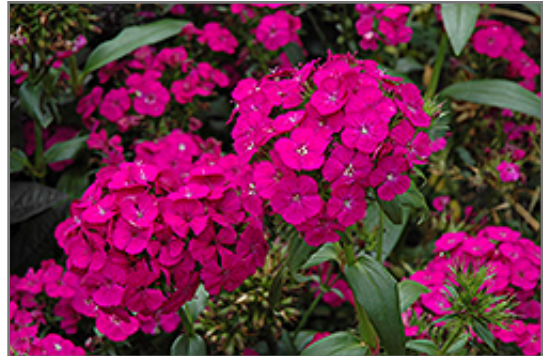
Amazon Neon Purple Pinks flowers

Amazon Neon Purple Pinks is recommended for the following landscape applications;