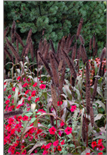
Purple Baron Millet in bloom

Purple Baron Millet is recommended for the following landscape applications;