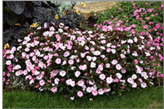
SunPatiens Compact Blush Pink New Guinea Impatiens in bloom

This plant will require occasional maintenance and upkeep, and should not require much pruning, except when necessary, such as to remove dieback. It has no significant negative characteristics.