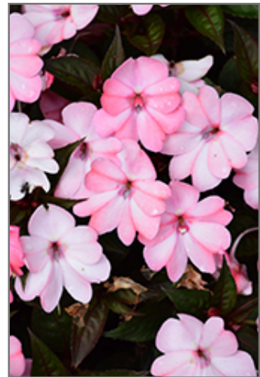
SunPatiens Compact Blush Pink New Guinea Impatiens flowers