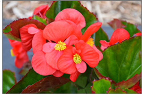
Big Red Green Leaf Begonia flowers