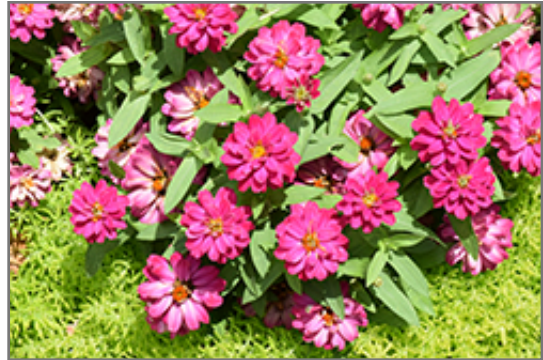
Zahara Double Cherry Zinnia flowers

Zahara Double Cherry Zinnia will grow to be about 16 inches tall at maturity, with a spread of 16 inches. When grown in masses or used as a bedding plant, individual plants should be spaced approximately 12 inches apart. Its foliage tends to remain dense right to the ground, not requiring facer plants in front. This fast-growing annual will normally live for one full growing season, needing replacement the following year.