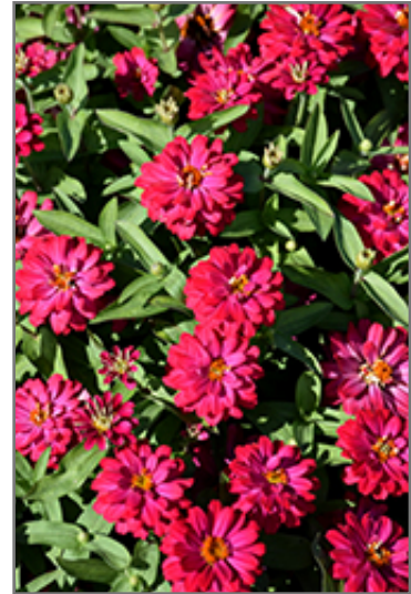
Zahara Double Cherry Zinnia flowers

Zahara Double Cherry Zinnia is recommended for the following landscape applications;