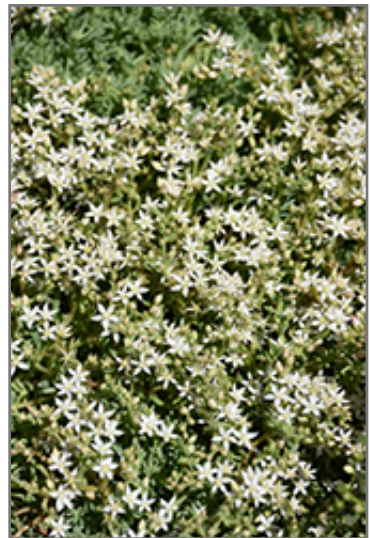
Dwarf Spanish Stonecrop flowers Photo courtesy of NetPS Plant Finder