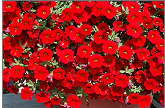
Cabaret Bright Red Calibrachoa flowers

This plant will require occasional maintenance and upkeep. Trim off the flower heads after they fade and die to encourage more blooms late into the season. It is a good choice for attracting bees and hummingbirds to your yard, but is not particularly attractive to deer who tend to leave it alone in favor of tastier treats. It has no significant negative characteristics.