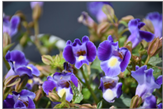
Catalina Midnight Blue Torenia flowers