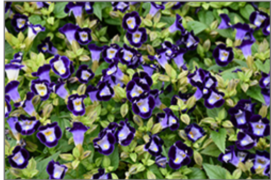
Catalina Midnight Blue Torenia flowers

This plant will require occasional maintenance and upkeep, and should not require much pruning, except when necessary, such as to remove dieback. It is a good choice for attracting bees and hummingbirds to your yard, but is not particularly attractive to deer who tend to leave it alone in favor of tastier treats. It has no significant negative characteristics.