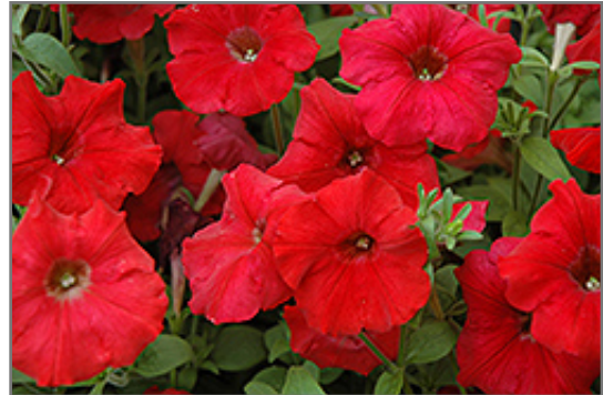
Easy Wave Red Petunia flowers

This plant will require occasional maintenance and upkeep. Trim off the flower heads after they fade and die to encourage more blooms late into the season. It is a good choice for attracting hummingbirds to your yard, but is not particularly attractive to deer who tend to leave it alone in favor of tastier treats. It has no significant negative characteristics.