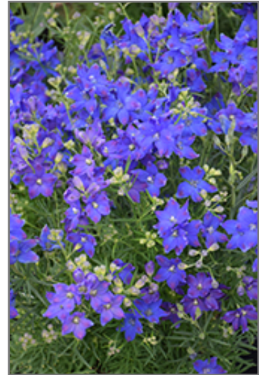
Diamonds Blue Delphinium flowers

Diamonds Blue Delphinium is recommended for the following landscape applications;