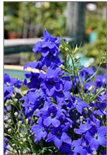
Diamonds Blue Delphinium flowers