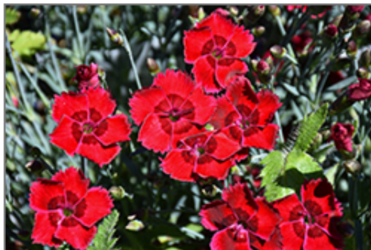
Fire Star Pinks flowers

This is a relatively low maintenance plant, and is best cleaned up in early spring before it resumes active growth for the season. It is a good choice for attracting bees and butterflies to your yard, but is not particularly attractive to deer who tend to leave it alone in favor of tastier treats. It has no significant negative characteristics.