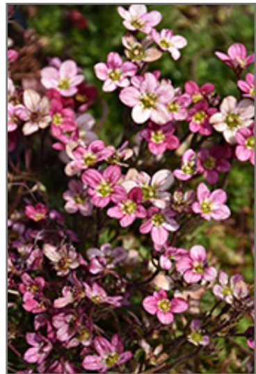
Purple Robe Saxifrage flowers