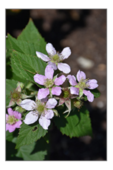
Chester Thornless Blackberry flowers