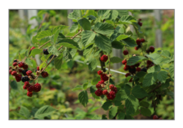
Chester Thornless Blackberry fruit

This shrub may not always play well with others; as such, it is best grown in its own designated garden space or isolated area of an edibles garden. It should only be grown in full sunlight. It prefers to grow in average to moist conditions, and shouldn't be allowed to dry out. It is not particular as to soil type or pH. It is somewhat tolerant of urban pollution. This particular variety is an interspecific hybrid. It can be propagated by division; however, as a cultivated variety, be aware that it may be subject to certain restrictions or prohibitions on propagation.