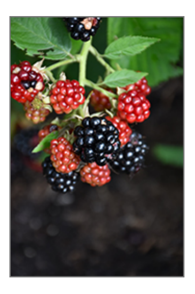
Chester Thornless Blackberry fruit

Chester Thornless Blackberry has rich green deciduous foliage on a plant with a spreading habit of growth. The fuzzy oval compound leaves do not develop any appreciable fall color. It features an abundance of magnificent black berries in mid summer.