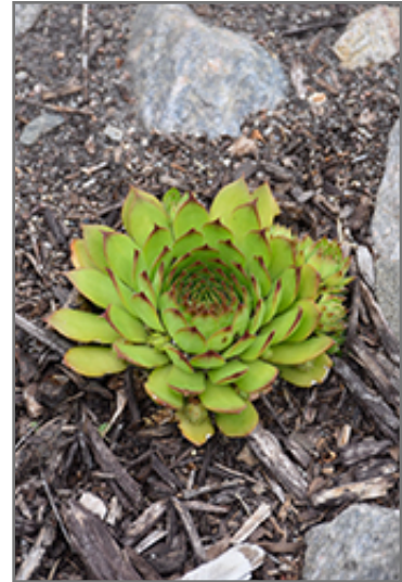
Sunset Hens And Chicks