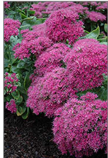
Neon Stonecrop flowers

This is a relatively low maintenance plant, and is best cleaned up in early spring before it resumes active growth for the season. It is a good choice for attracting bees and butterflies to your yard, but is not particularly attractive to deer who tend to leave it alone in favor of tastier treats. It has no significant negative characteristics.