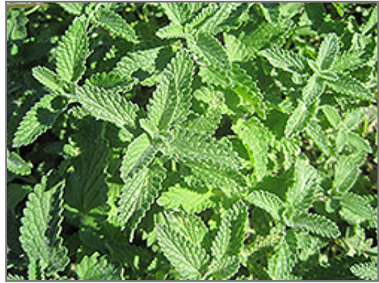
Walker's Low Catmint foliage

Walker's Low Catmint is a fine choice for the garden, but it is also a good selection for planting in outdoor pots and containers. It is often used as a 'filler' in the 'spiller-thriller-filler' container combination, providing a mass of flowers against which the thriller plants stand out. Note that when growing plants in outdoor containers and baskets, they may require more frequent waterings than they would in the yard or garden.