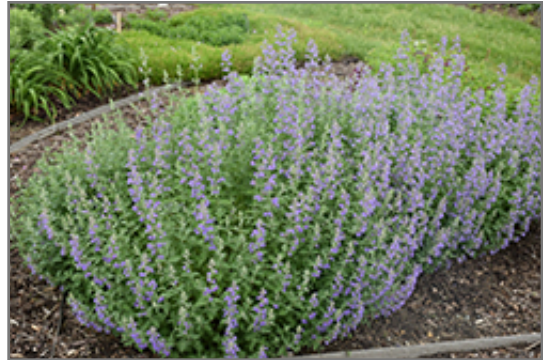
Walker's Low Catmint in bloom