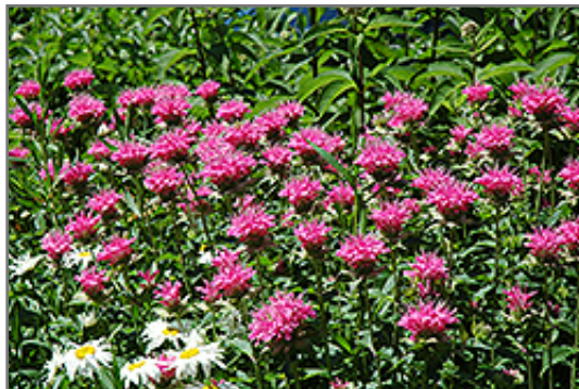
Marshall's Delight Beebalm flowers