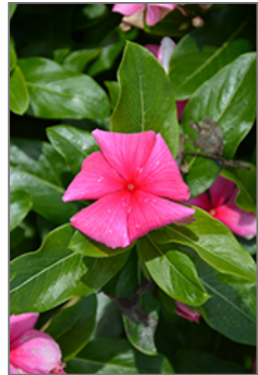
Cora XDR Deep Strawberry flowers

Cora XDR Deep Strawberry is recommended for the following landscape applications;