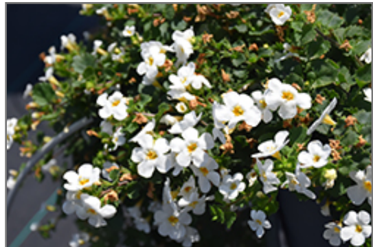
Snowstorm Snow Globe Bacopa flowers