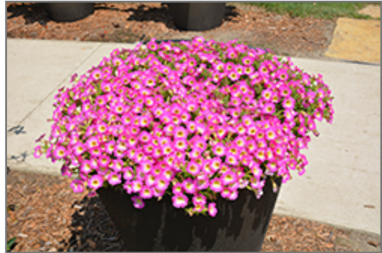
Supertunia Daybreak Charm Petunia in bloom