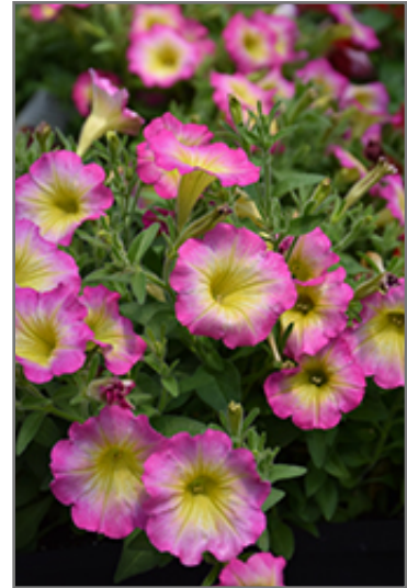
Supertunia Daybreak Charm Petunia flowers

Supertunia Daybreak Charm Petunia is a dense herbaceous annual with a trailing habit of growth, eventually spilling over the edges of hanging baskets and containers. Its medium texture blends into the garden, but can always be balanced by a couple of finer or coarser plants for an effective composition.