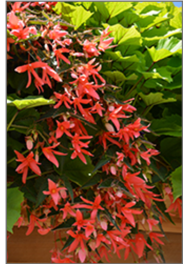
San Francisco Begonia flowers