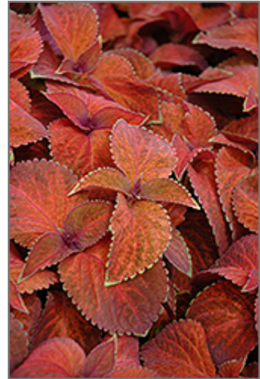
Wizard Sunset Coleus foliage

Wizard Sunset Coleus is recommended for the following landscape applications;