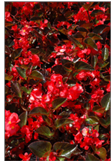
Big Red Bronze Leaf Begonia flowers