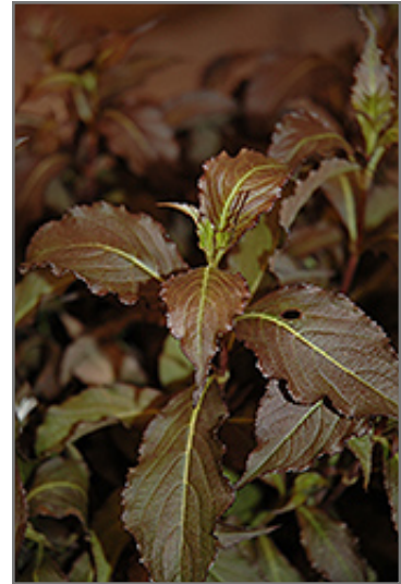
Spilled Wine Weigela foliage

Spilled Wine Weigela makes a fine choice for the outdoor landscape, but it is also well-suited for use in outdoor pots and containers. Because of its height, it is often used as a 'thriller' in the 'spiller-thriller-filler' container combination; plant it near the center of the pot, surrounded by smaller plants and those that spill over the edges. It is even sizeable enough that it can be grown alone in a suitable container. Note that when grown in a container, it may not perform exactly as indicated on the tag - this is to be expected. Also note that when growing plants in outdoor containers and baskets, they may require more frequent waterings than they would in the yard or garden.