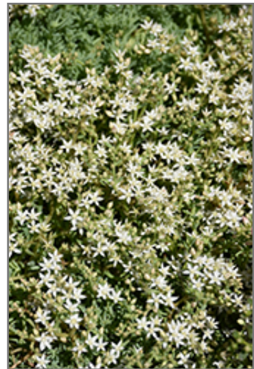
Dwarf Spanish Stonecrop flowers