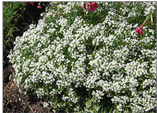
Wonderland White Alyssum in bloom