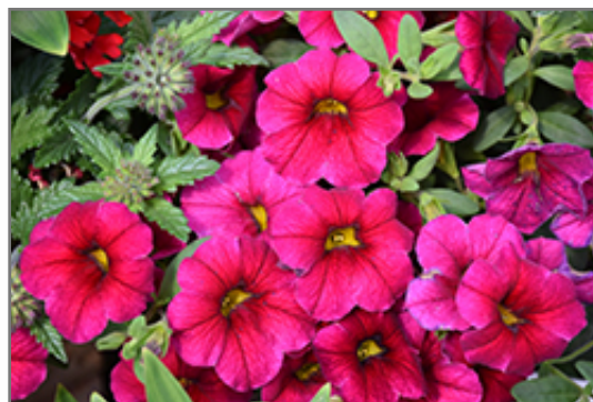
Superbells Cherry Red Calibrachoa flowers