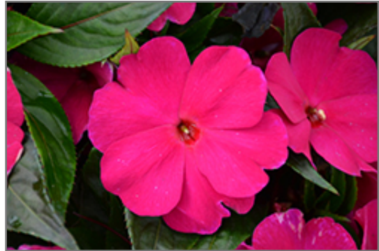
Magnum Purple New Guinea Impatiens flowers