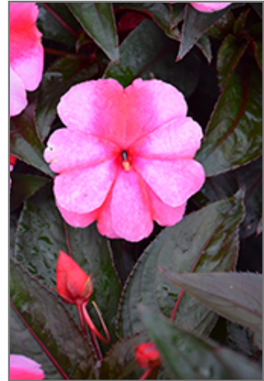
Super Sonic Sweet Cherry New Guinea Impatiens flowers

Super Sonic Sweet Cherry New Guinea Impatiens is recommended for the following landscape applications;