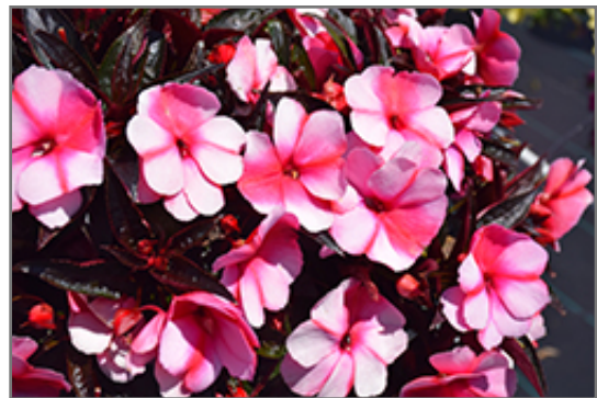
Super Sonic Sweet Cherry New Guinea Impatiens flowers